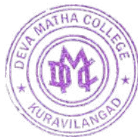
Principal Deva Matha College Kuravilangad - 686 633